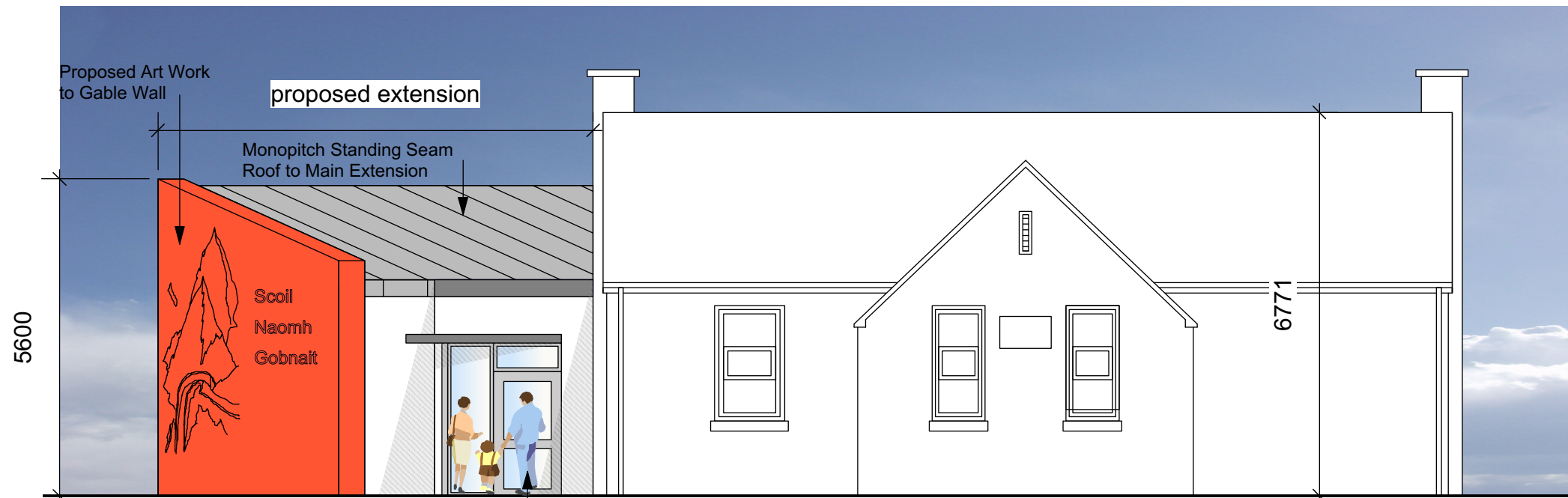
PROPOSED FRONT ELEVATION SCALE 1:100 @ A3

New Main Entrance Set Back from Main Building